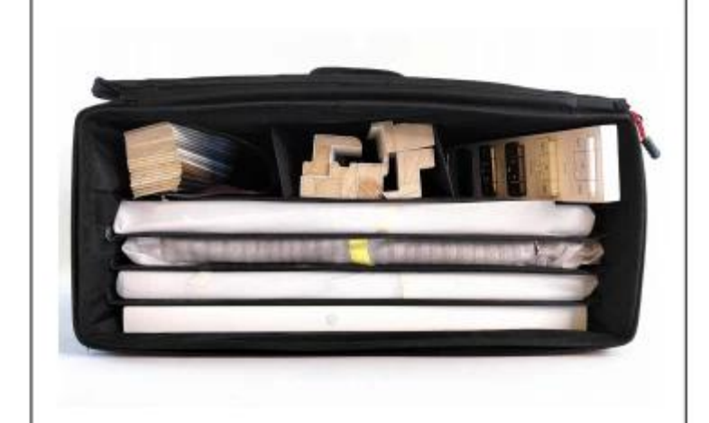
款式 3—PV 箱 Style 3—PV box