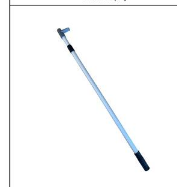
伸缩杆 4 side display