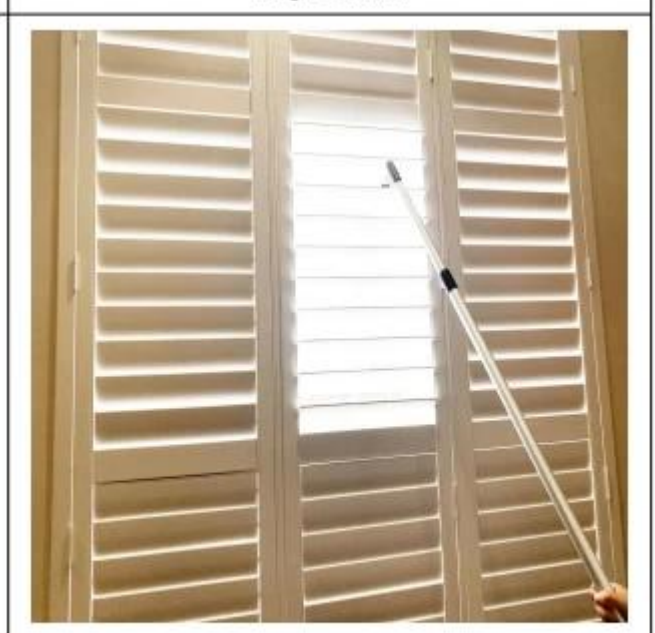
使用场景 Usage scenario