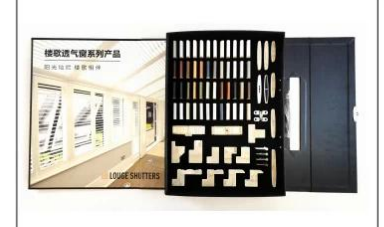
款式 2一尼龙包 Style 2—Nylon bag