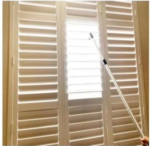
使用场景 Usage scenario