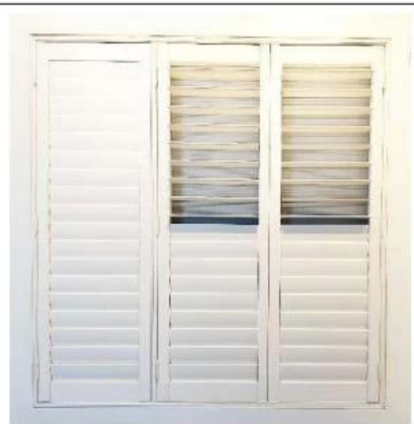
使用场景 Usage scenario