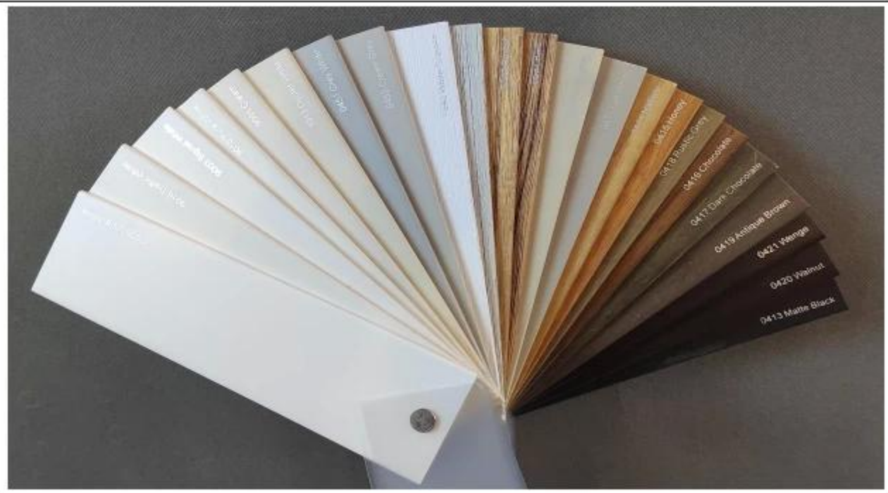
Sample box style and details