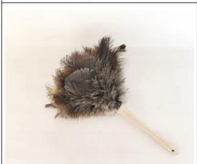
鸵鸟毛掸子 Ostrich feather duster