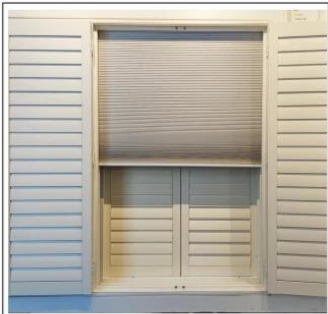
蜂巢帘 Honeycomb Blinds