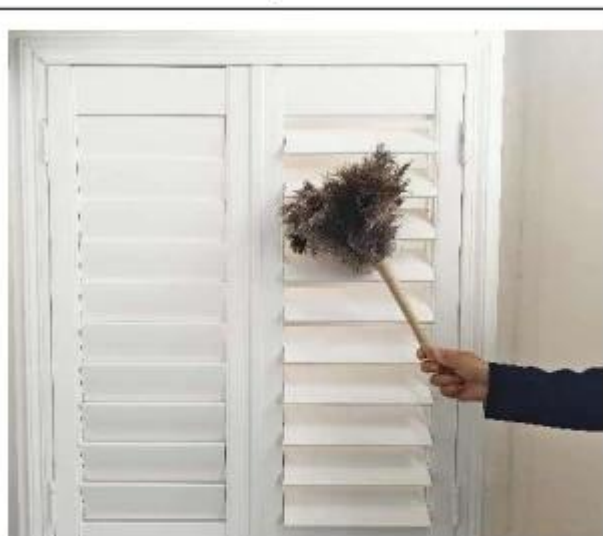
使用场景 Usage scenario