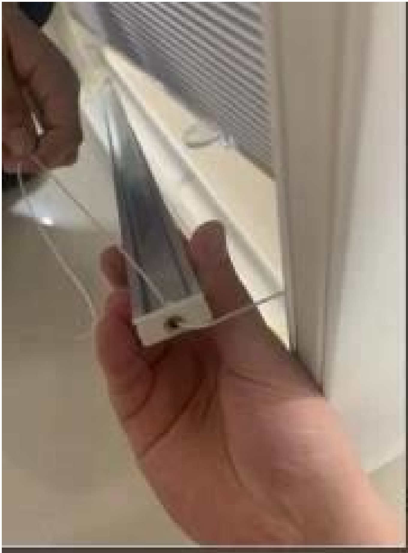
9. Blinds can be removed by pressing down on the back of the bracket and the blind will release.