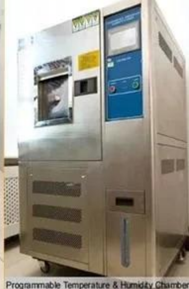
Programmable Temperature & Humidity Chamber