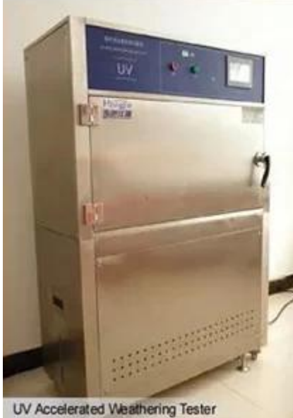
UV Accelerated Weathering Tester