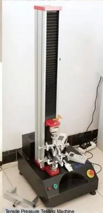
Tensile Pressure Testing Machine