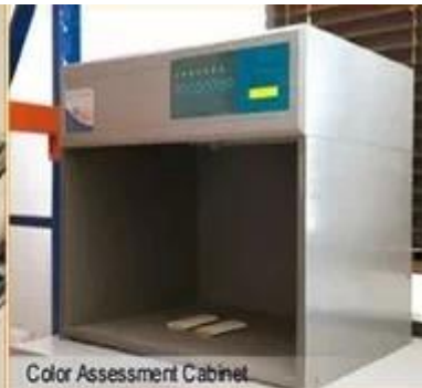
Color Assessment Cabinet