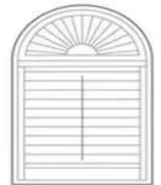
Sunburst Above Shutters