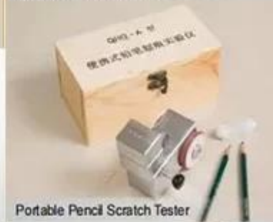
Portable Pencil Scratch Tester