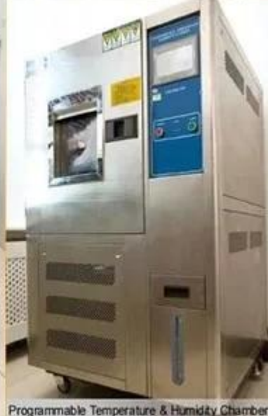
Programmable Temperature & Humidity Chamber