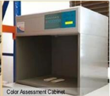
Color Assessment Cabinet