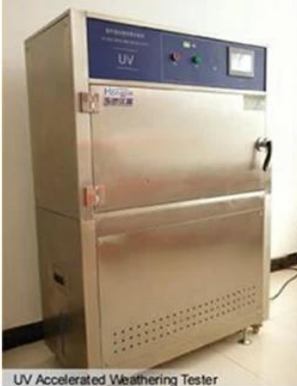
UV Accelerated Weathering Tester