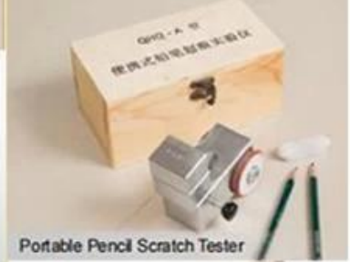
Portable Pencil Scratch Tester