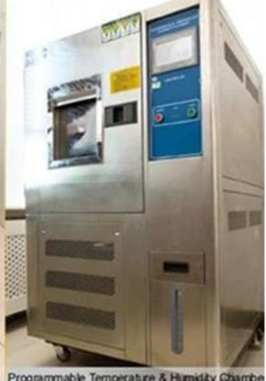
Programmable Temperature & Humidity Chamber