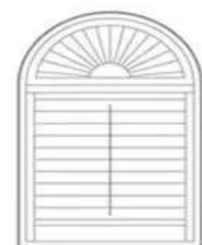
Sunburst Above Shutters