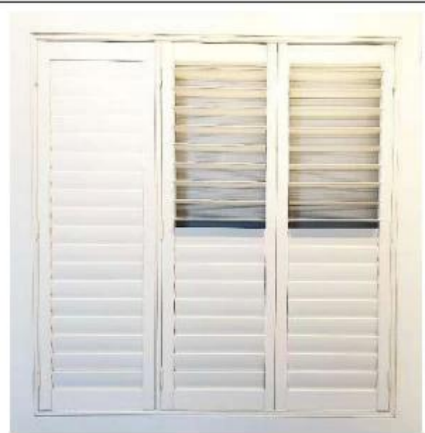
使用场景 Usage scenario