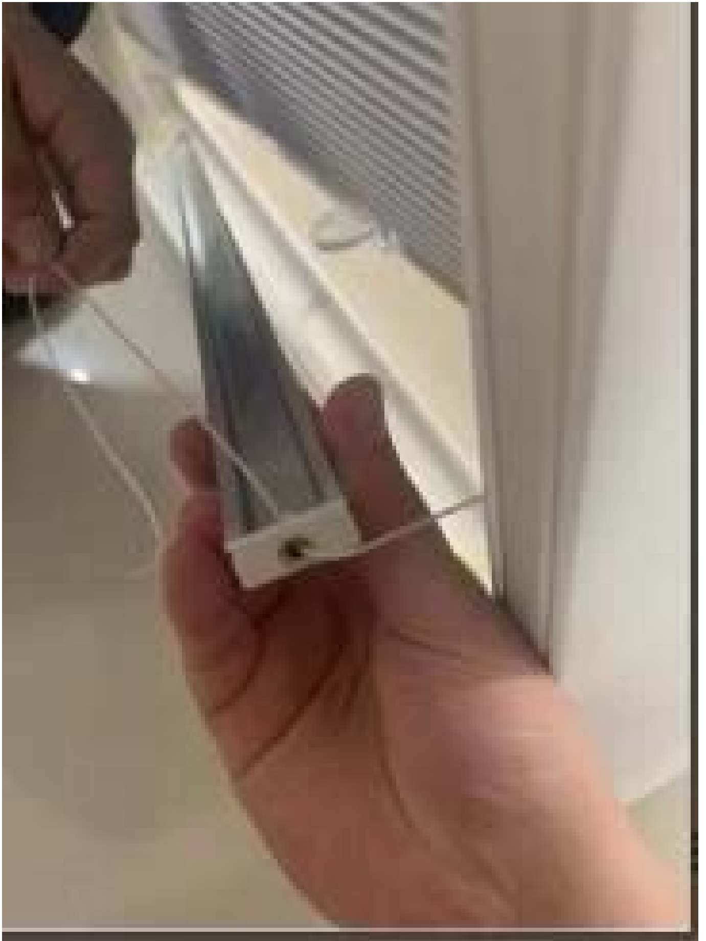
9. Blinds can be removed by pressing down on the back of the bracket and the blind will release.