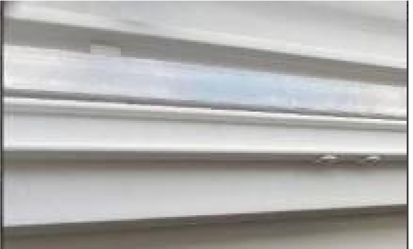
8. When raising/lowering, the cords are protected via the smooth eyelet rings.