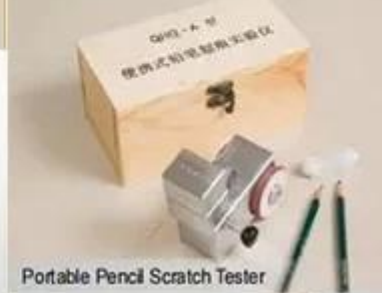
Portable Pencil Scratch Tester