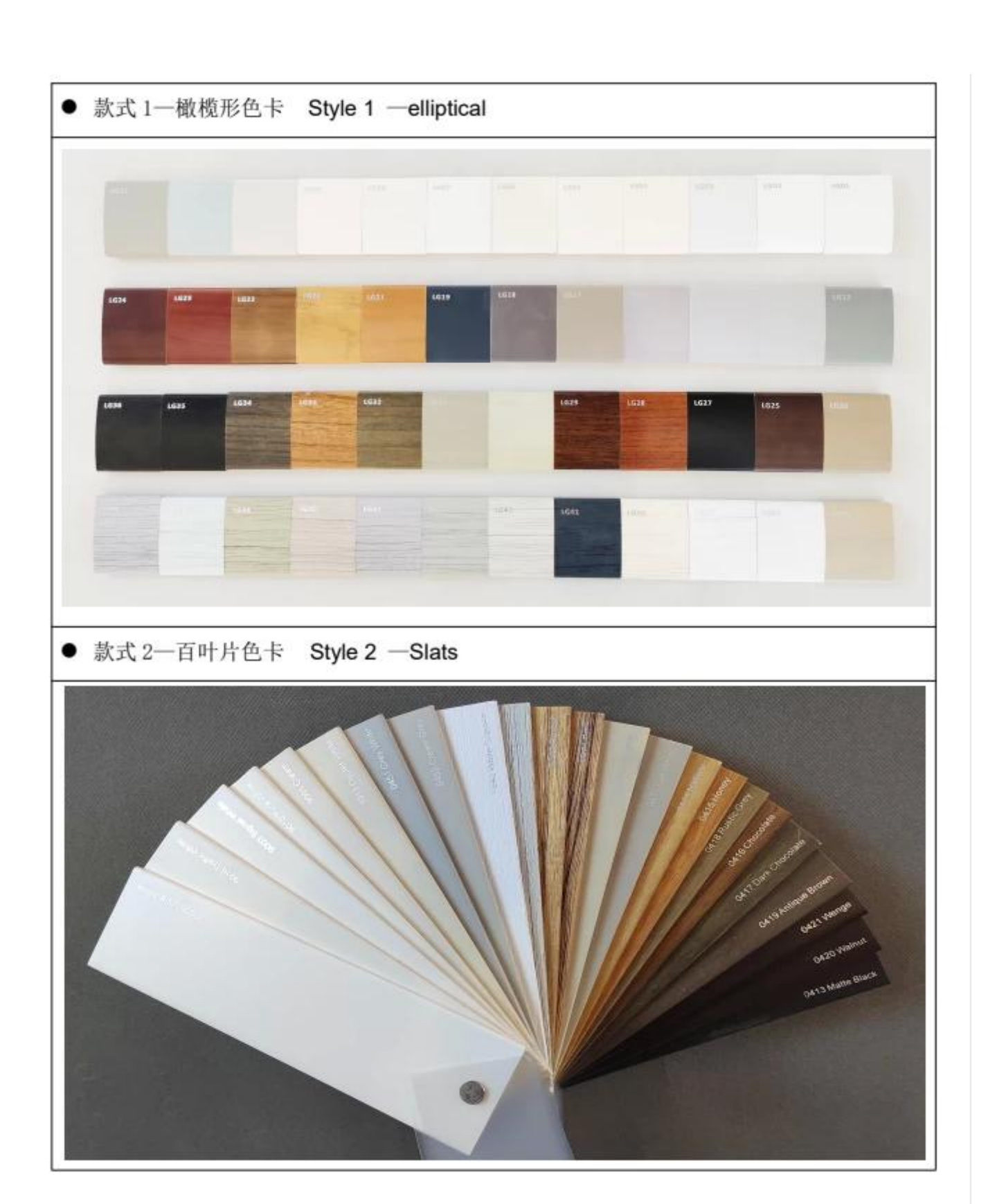
Sample box style and details