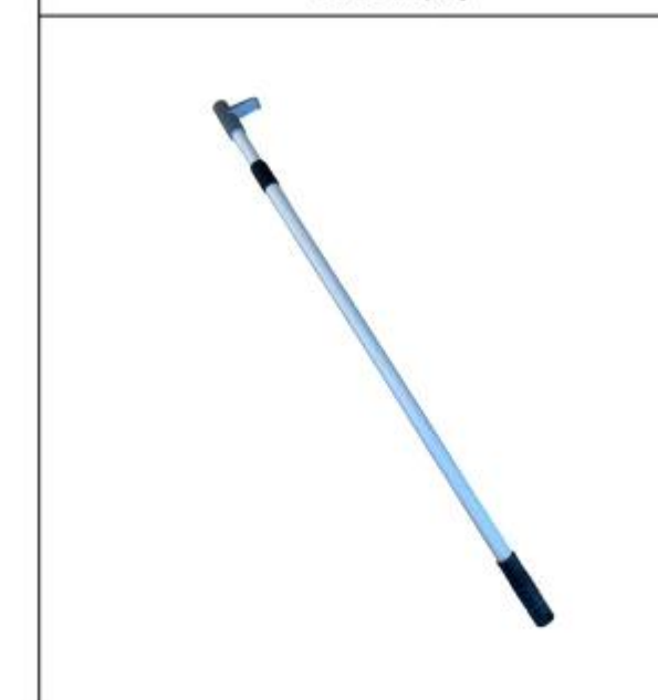
伸缩杆 4 side display